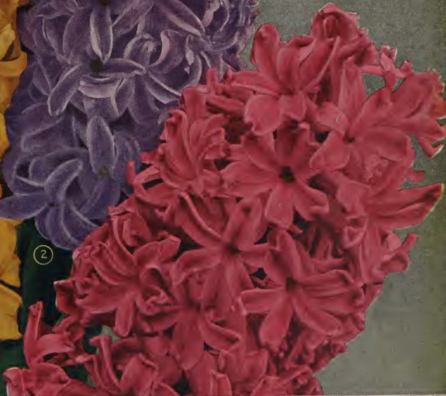
Matchless Dark Pink